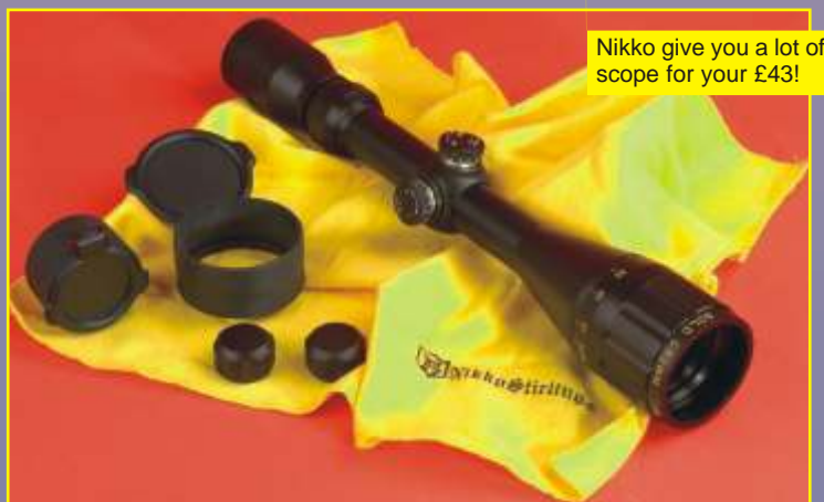
Nikko give you a lot of scope for your £43!

Forty-three quid? Go get two – now... before ASI realise they can put their prices up!