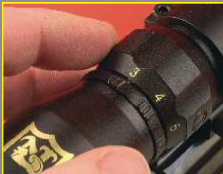
Whether the magnification's 3x or 9x the sight picture is always clear, bright and sharp!