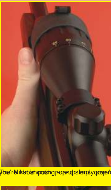
The Nikko's pop-up covers simply cover the turret when you're not shooting.