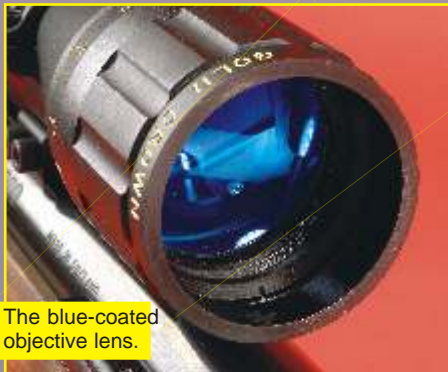
The blue-coated objective lens.

For general fieldwork, I left the Nikko's